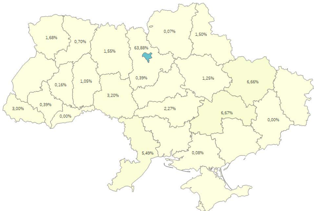
Fig. 1. Share of Ukraine's regions in the total volume of realized high-tech production in 2023, %

A key methodological feature of the source data is the presence of a significant