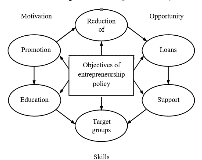
Fig. 1. The framework of entrepreneurship policy measures

This research provides the necessary framework for business policy activities to fully assess the business policy environment of SMEs (Lowrey, 2003). Some of the aims for executing the entrepreneurship strategy include creating an entrepreneurial climate, fostering entrepreneurship, establishing good attitudes toward entrepreneurs, and increasing the number of company start-ups/new firm formation/new entities. This model combines the elements of motivation, capacity, and opportunity that will effect the growth of new businesses: loans and initial capital/seed capital for new businesses, and assistance in the formation of new businesses (incubators, orientation, first stop shops, networks), changes in prohibition/taxation and entrance barriers, enhancement of business culture and institutions, and reduction of failure stigma. business education, and telecommunication services in schools (e.g. young women, unemployed). Fig. 1 shows the framework of entrepreneurial regulation developments.